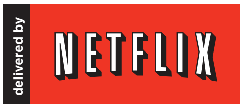
2-Color API Logo This is our primary signature.

To provide our customers with the most consistent, optimal experience, please use the approved electronic files only when including the logo in your design layout.